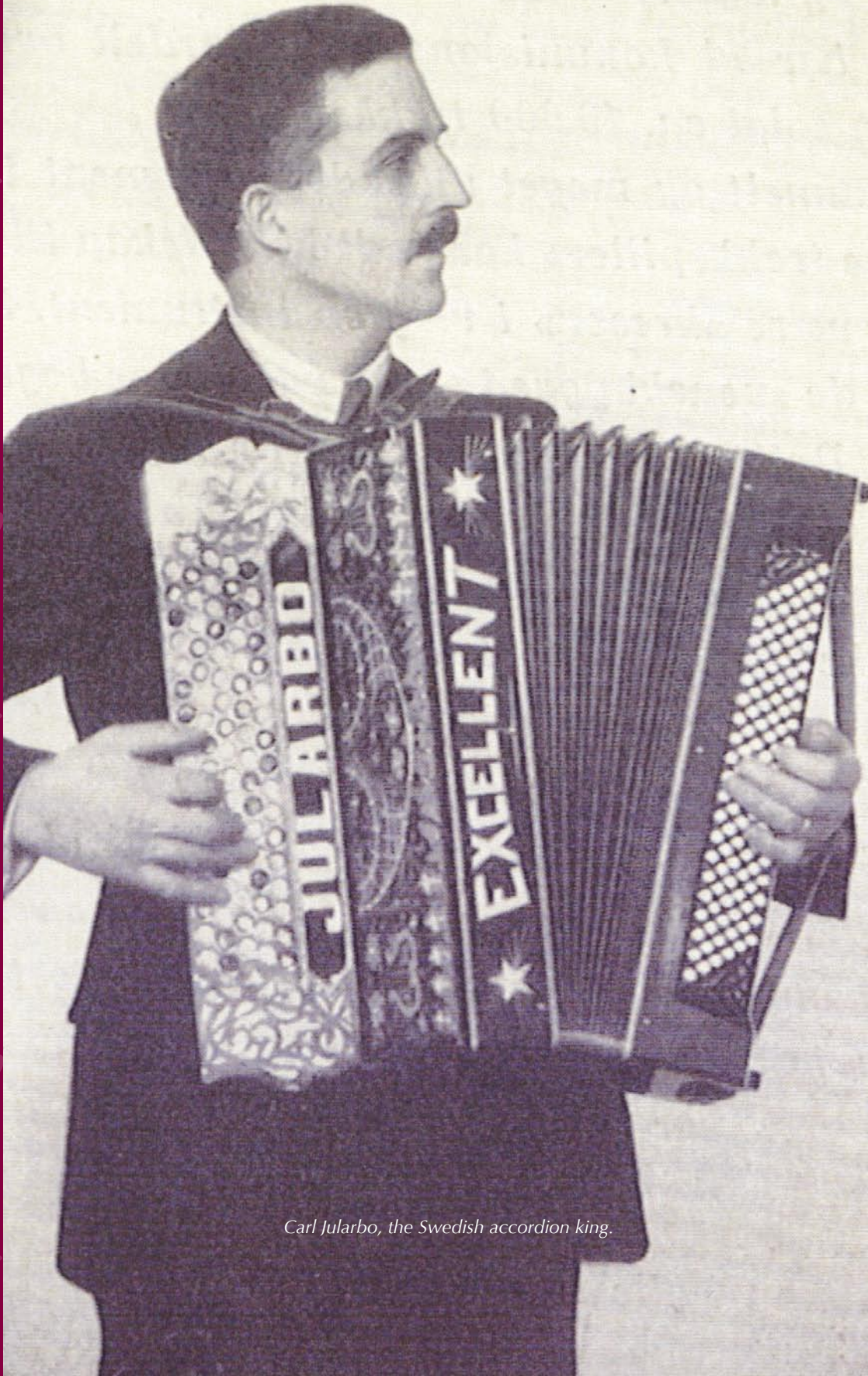
Carl Jularbo, the Swedish accordion king.